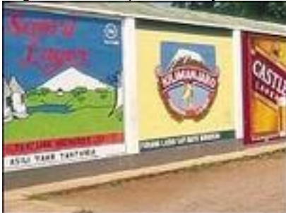
Original source: http://newsimg.bbc.co.uk/media/images/39910000/jpg/_39910693_tanzania_web203.jpg (Accessed 2008)